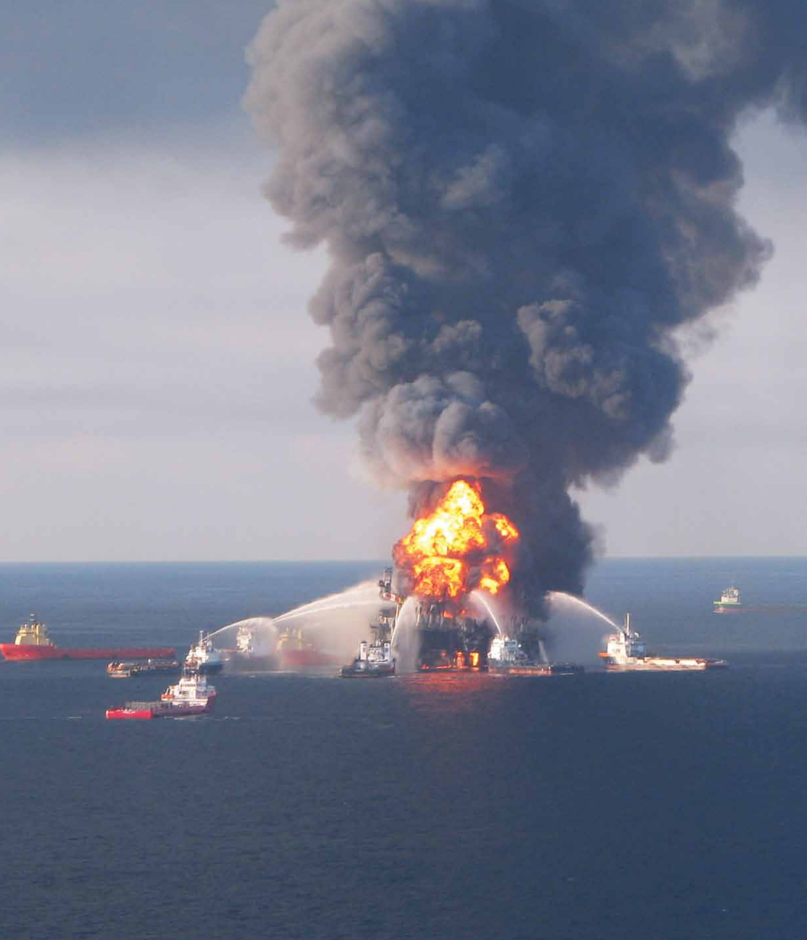
Fire-boat response crews battle the blazing remnants of the offshore oil rig Deepwater Horizon . Multiple Coast Guard helicopters, planes, and cutters responded to rescue the 126-person crew.