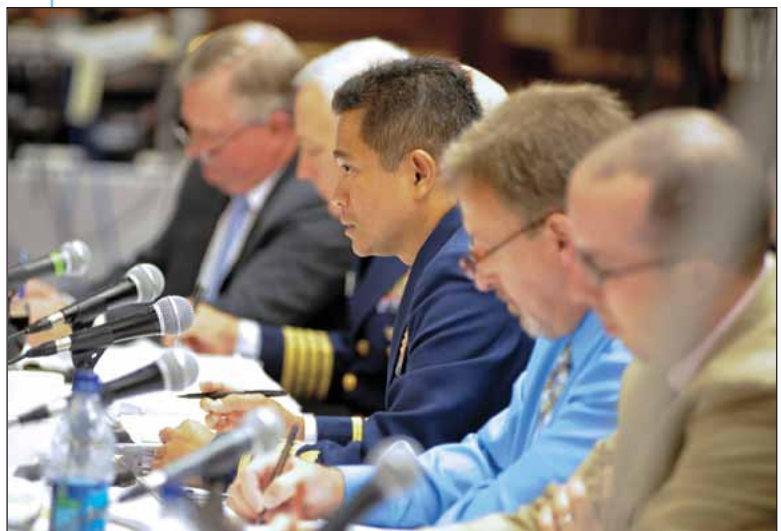
Members of the Deepwater Horizon joint investigation board prepare to question a witness.

There was a significant amount of underwater video of the Macondo well from the response efforts, but very little video footage of the vessel itself. Due to the lack of video footage that documented the wreckage of the